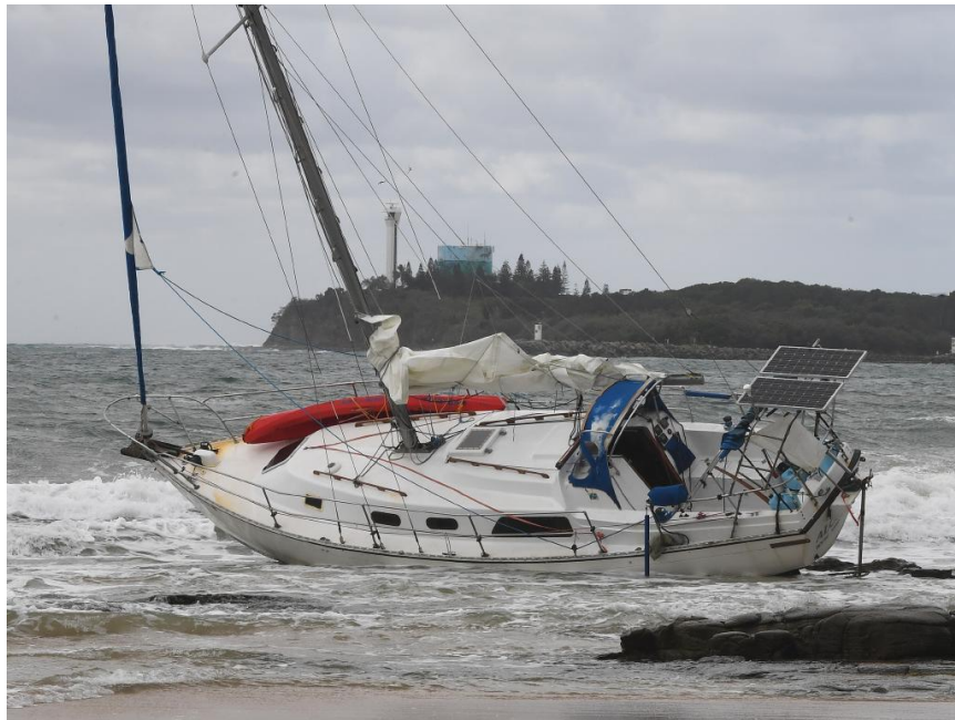
The Alcobri yacht washed up on the rocks at Mooloolaba.