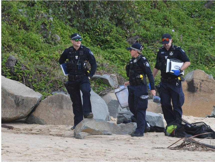
Police at the scene of the shipwreck at Mooloolaba.

But the question remained what would Australian authorities say when he showed up unannounced.