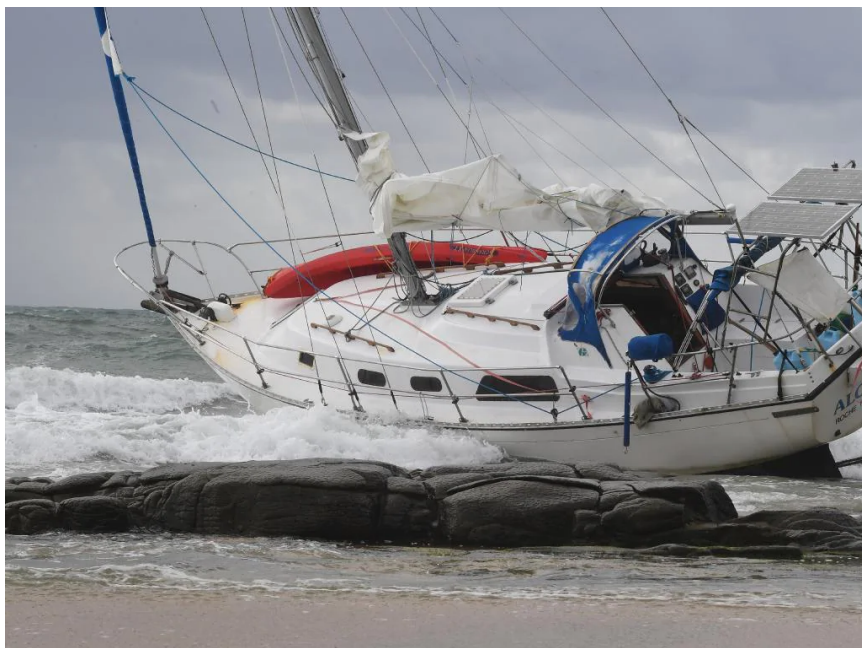
The Alcobri yacht washed up on the rocks at Mooloolaba.